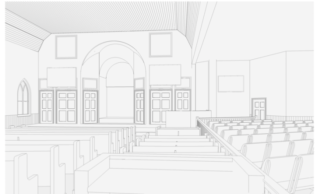
③ SANCTUARY VIEW 3