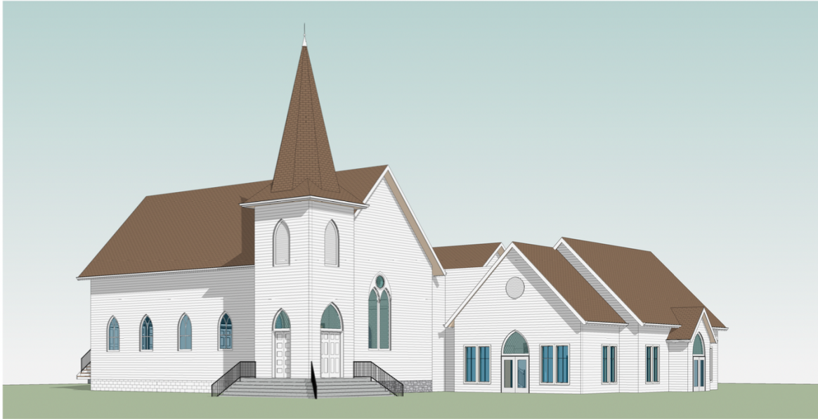
SCHEMATIC VIEW 01

Proposed Design: The following renderings have been created to demonstrate the design features, look and feel, and functionality of the finished expansion. A final set of 3-Dimensional renderings will be presented at the all-congregation information and discussion meeting on Sunday, March 30, 11:45 a.m. – 1:00 p.m.