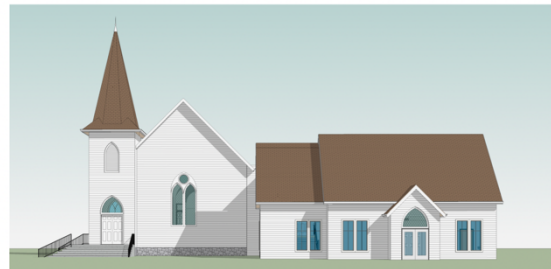
SCHEMATIC VIEW 02