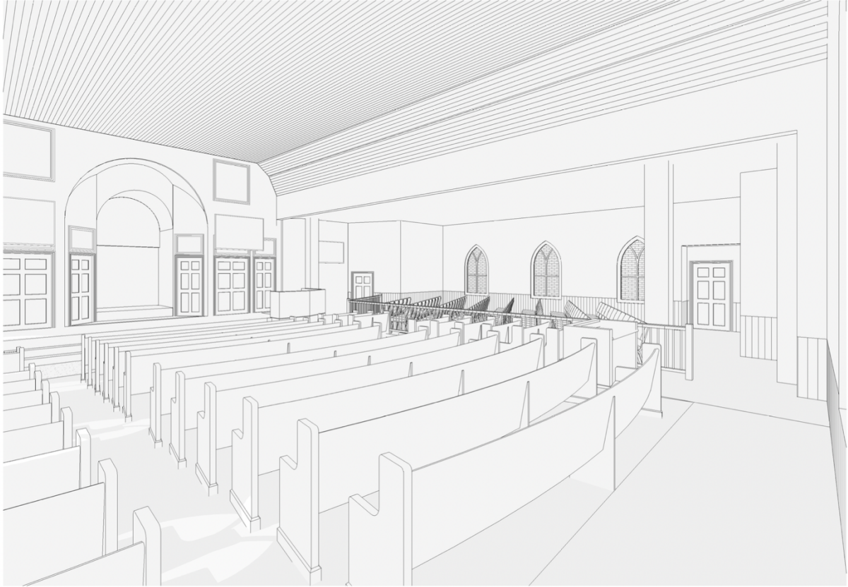
① SANCTUARY VIEW 1