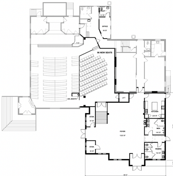
SCHEMATIC FLOOR PLAN 1/8" = 1'-0"